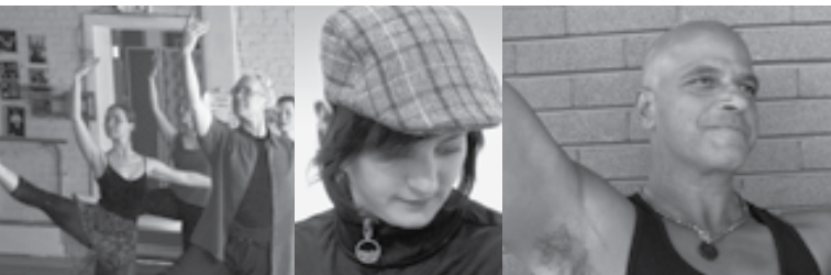
Design: Maslany Creative